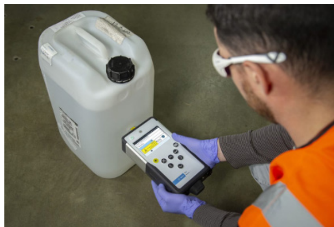
Figure 2. A Vaya verifies the identity of acetic acid in an opaque plastic carboy container.

By verifying ID directly through the container, a Vaya system helps preserve inert packaging conditions and maintain the expiration date of raw materials. For air sensitive materials like polysorbates, it means that materials can be fully used before the expiration date instead of being discarded. This alone can easily translate into savings >$100 per tested container.