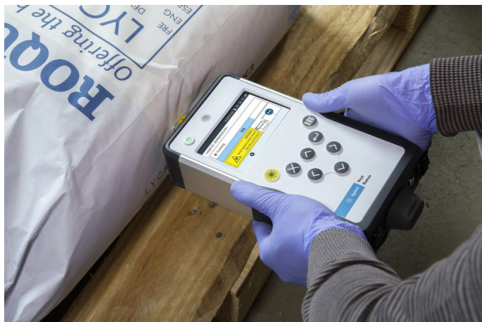
Figure 1. Vaya identifies raw materials through multilayer paper sacks.

The Vaya is a handheld SORS-based spectrometer from Agilent. The Vaya is the fastest handheld identity verification solution available. For example, it can verify lactose monohydrate in a three-layer paper bag in 80 seconds. Citric acid in a white HDPE bottle can be identified in 15 seconds with no sampling and no mess. It drastically simplifies the identification process by enabling almost instantaneous screening of incoming containers on arrival. The Vaya system can verify the identity of raw materials in quarantine with a single operator. Unnecessary movement of containers, sampling booth clean up, sampling consumables, and PPE for testing personnel are all reduced.